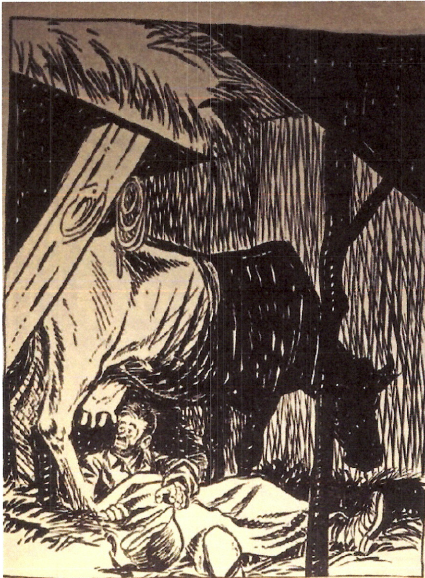
Breakfast in bed

soldiers for whom he drew; his gripes were their gripes, his laughs their laughs, his heartaches their heartaches. He was one of them. They loved him.